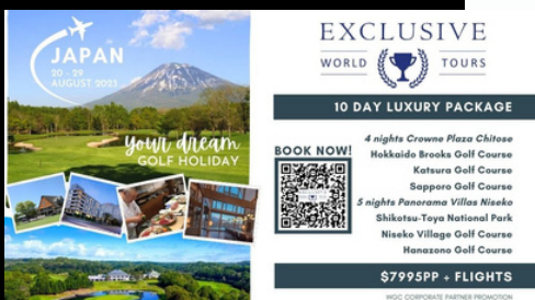
WGC advertising screen