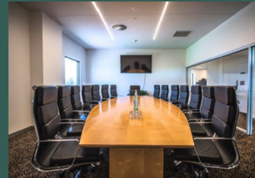
Board Room the 19th